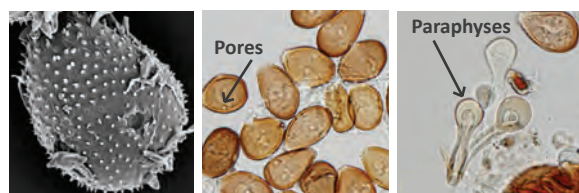
FIGURE 2 | Brown rust spores. Optimum temperature for brown rust spore germination is 11-27°C.