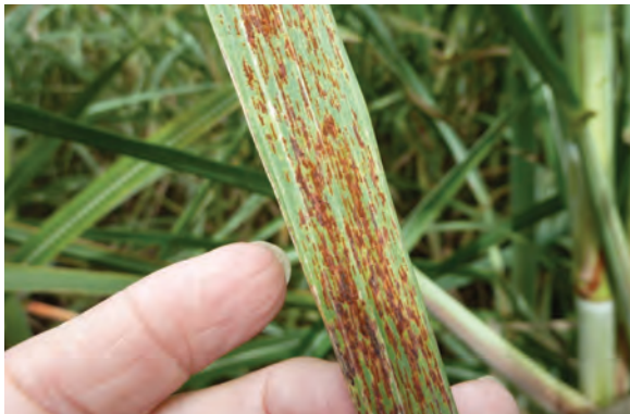
Diseased leaf with orange rust lesions.