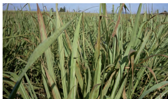
PHOTO 2 | Brown rust in Q190 fl . Pustules are more towards the tip.

Brown rust yield loss research was carried out soon after the disease entered Australia, in the late 1970s to the early 1980s. Trials were undertaken with fungicides and in the most susceptible varieties losses were around 25%. As with orange rust, losses will vary with season and weather conditions.