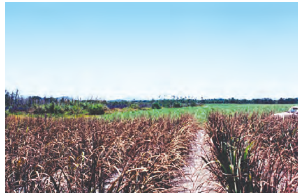
Brown rust in a field of young Q117 plant cane.