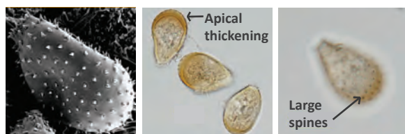
FIGURE 1 | Orange rust spores. Optimum temperature for orange rust spore germination is 17-23°C.

pustules are spread evenly, located more towards the leaf tip (Photo 2). Orange rust spores are larger than brown rust and golden-orange in colour (Figure 1). By looking at the spores under the microscope, you can easily see that the spores have a thick wall at the apex and have large spines.