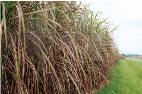
A diseased crop of Q124 – dead leaves on standing cane caused by orange rust.

Planting no more than 30-40% of any one variety on a farm is a good strategy to limit the risks from disease outbreaks.