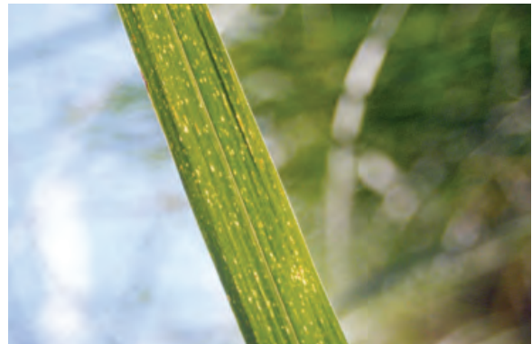
In brown rust the initial yellow spots on the leaves increase in size and turn a rusty brown.